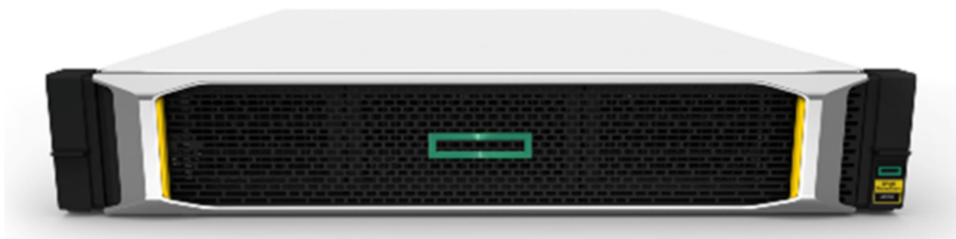
HPE MSA 1050 SAN Storage

Notes: *US Street Price (MSA 1050 base unit, dual 1GbE iSCSI controllers, four 300GB HDDs); prices are subject to change without notice.