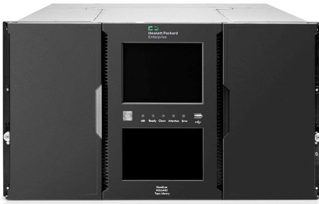
HPE StoreEver MSL6480 Tape Library

The HPE StoreEver MSL6480 Tape Library is the gold standard for mid-range tape automation, delivering best-in-class scalability, density, and performance to meet your short-term backup and disaster recovery data protection needs, as well as long-term archive requirements. Keep pace with data growth by seamlessly scaling up to 7 modules-without disrupting daily data protection. The MSL6480 also saves floor space by providing the highest tape drive density per module of any mid-range tape library. The MSL6480 Tape Library reduces the time and resources needed to achieve enterprise-class manageability, equipping you with proactive monitoring on single pane of glass control. The HPE StoreEver MSL6480 Tape Library can also provide medium sized businesses with a last line of defense solution against the threat of ransomware due to its air-gapped, offline capabilities.