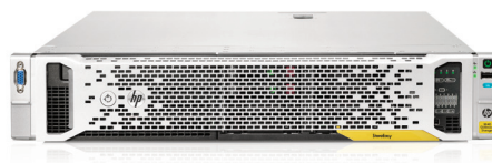
HPE StoreEasy 3850 Gateway