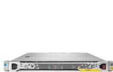
HPE StoreEasy 1450 Storage