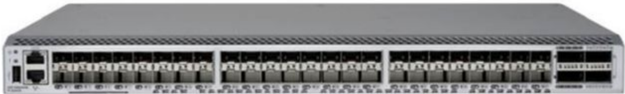
HPE Storage Fibre Channel Switch B-series SN6600B Q0U58C & R6V47A have a mini-USB console/serial port instead of an RJ-45